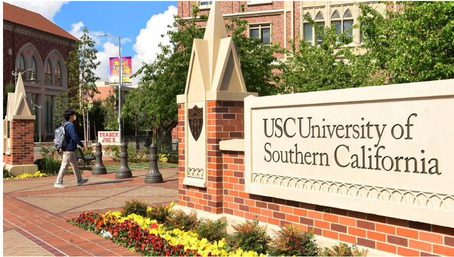
image of USC sign