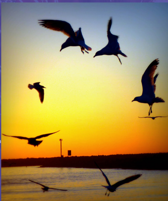
Leticia Lua, Seagull Soiree