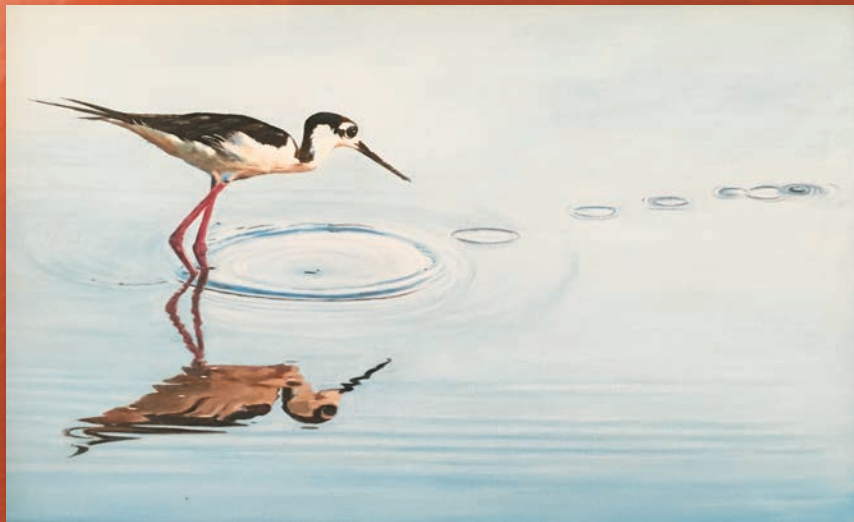
Rose Carcich, Tranquility , Oil on Canvas, 11" x 14"