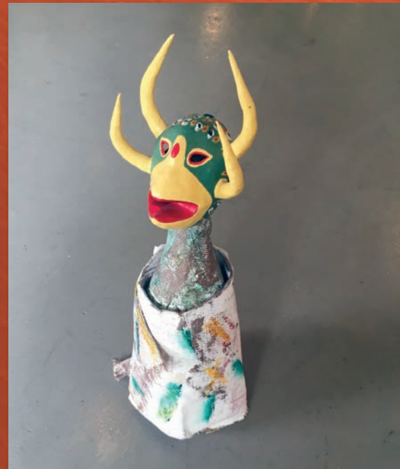
Evelyn Debes, Entity , Mixed Media Sculpture, 14" H