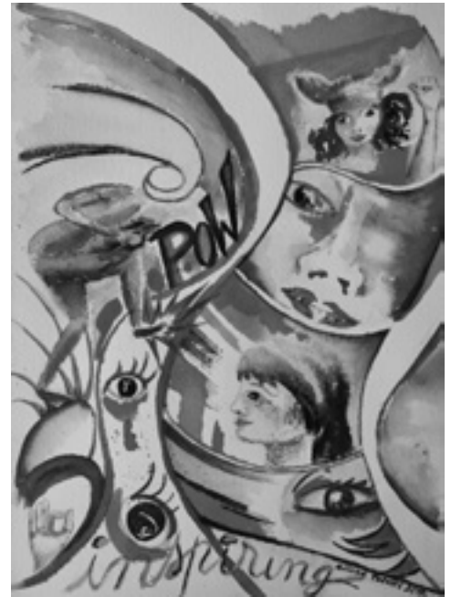
Helene Poletti, Pow Now , 15"x11", watercolor

The goal is for past and active students to engage and support programmatic and personal excellence! Any donation is valuable as you join a community of bighearted supporters at SMC Emeritus. Please consider donating today by calling (310) 434-4306 or visit the main office at 1227 Second Street, Santa Monica.